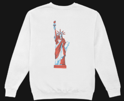
Urban Sweat Shirt