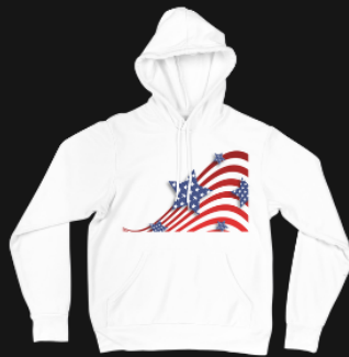
Street Smart Hoodie