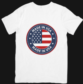
City of Tee